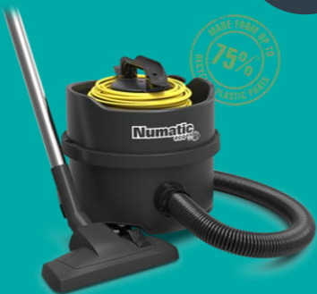
Made from up to 75% of Recycled plastics parts

MCR Group use only materials that can be reused to deliver cleaning services at MacDonagh Junction. The materials and equipment used on site are made from second life plastics. Using recycled materials helps to reduce greenhouse gas emissions by reducing energy. Cleaning cloths are laundered on site to further reduce our carbon footprint.